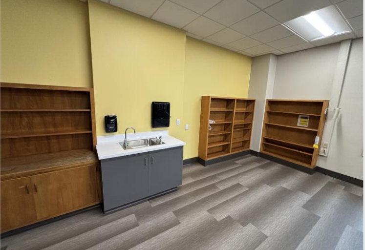
New sink and casework installed against the room's accent wall!