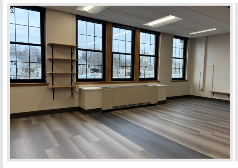
New unit ventilator installed with wingwall countertops on top of the new flooring system!